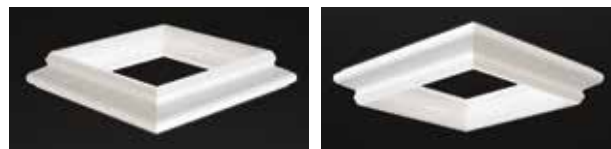
BASE CAP MOULDING SET Available for 4", 6", 8" and 10" post wraps