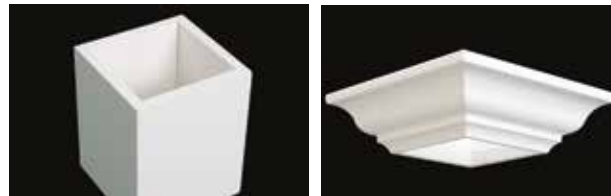
OUTER WRAP Available in 5", 7" and 12" lengths for 4", 6", 8" and 10" post wraps; 1/2" thick

KLEERWrap accessories are available for all post wrap sizes.