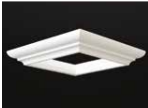
KLEERWRAP BED MOULDING SETS Included with Post Wrap and sold separately.