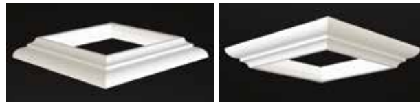
BED MOULDING SET Available for 4", 6", 8" and 10" post wraps